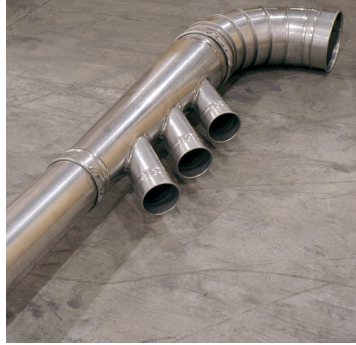
Clamp pieces on ground