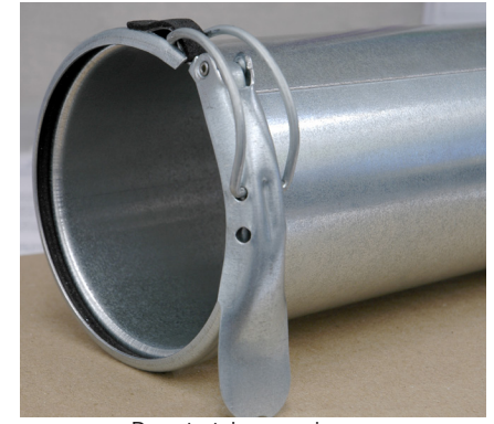
Pre-stretch your clamps

STEP SEVEN: Pre-Stretch Your Clamps . The Nordfab clamps are designed to provide a tight seal, which means that they also require some pressure to close. By pre-stretching the clamp around the rolled edge of a single piece of pipe, you can make it much easier to close when you connect two pieces together.