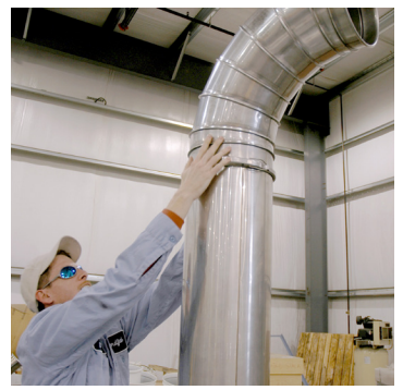
Lift pieces into place

IMPORTANT SAFETY NOTE: The ducting must be properly supported. It is unsafe to have several segments cantilevered without support. Each additional piece of pipe puts enormous amounts of pressure on the clamps and hangers which could result in catastrophic clamp or hanger failure.