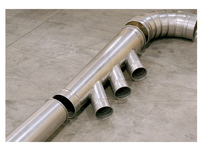
Lay your system out on the floor

NOTE: This is the step where you could possibly find that you do not have all the parts necessary to complete the job. In that case, contact your